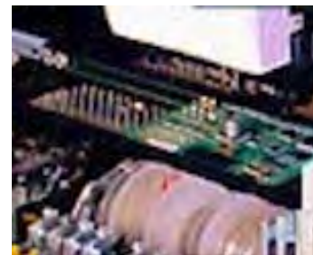
Semiconductor manufacturing process