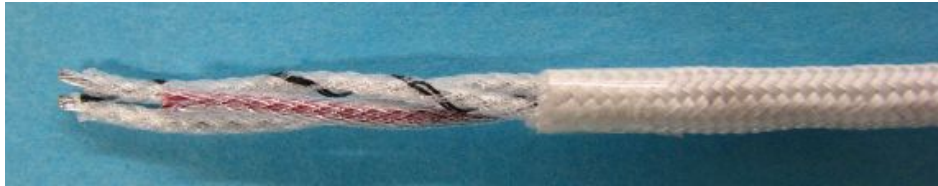
Fig.1: Schematic Diagram of the AD-HS Sensor

Electrode : 0.33 mm 2 tinned annealed copper wire Color changing: Polyester fibre filled with dye Inner sheathing: Polyethylene Outer sheathing: Polyester