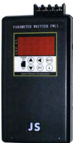
Parameter setting unit PWC1

Thermometer is equipped with a LED guide light for aiming at the target and for indication of the target spot size. It is also equipped with peak hold and smoothing function.