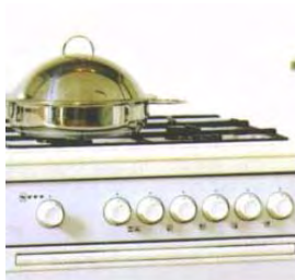
Heat insulation material inside kitchen utensils