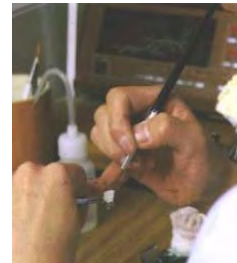
Shock absorber for dental die-casting