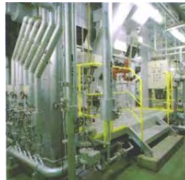
Packing inside high temperature machines