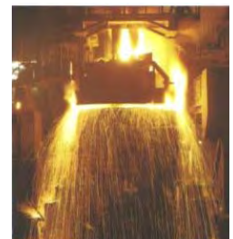
Insulation inside high temperature furnaces