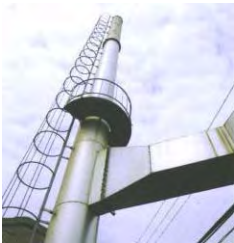
Filter cushion installed inside a chimney

It has wide range of applications from use as insulation material in domestic heating appliances to various industrial applications such as gasket/packing material for high temperature parts, filling material to allow brick expansion, packing material for thermocouple protection tubes protective material for induction furnace coil and as packing material inside boilers, driers and engines. Chemical resistance, erosion resistance as well as heat resistance makes it ideally suitable for filtering and absorbing gases or liquids in high temperature environment. Due to its shock absorbing characteristics it can be used as a cushion material for filter inside chimney at plants such as thermal power station or garbage processing plants. It is especially suitable for applications that need thin structure high temperature insulation material.