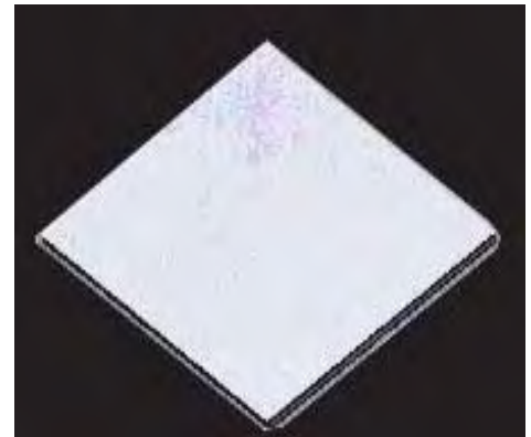
Square cut ceramic fiber paper