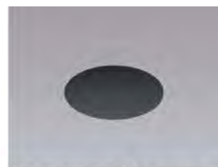
Protection seal for magnet A90127

DUE TO CONTINUOUS PRODUCT IMPROVEMENT, THE DESIGN AND TECHNICAL SPECIFICATIONS ARE SUBJECT TO CHANGE WITHOUT PRIOR NOTICE