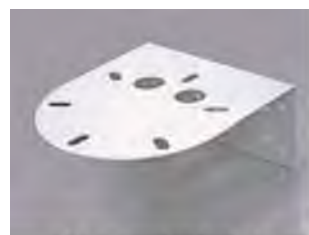
Wall mounting bracket A82709