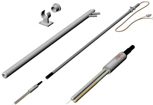
lance holder unit water cooled-lance insert core disposable oxygen sensor