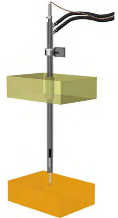
On-line Measurement in Industrial Glass Melting Furnaces